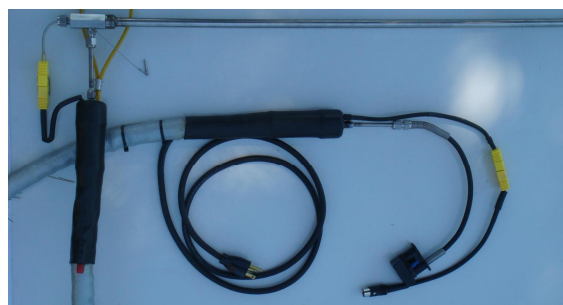
Probe and hose assembly with attached TC and TC leads.