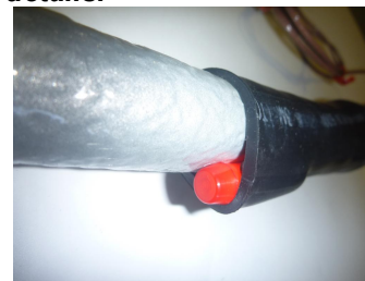
Bright LED shows correct operating temp.

Our heated lines are engineered with ® Teflon tubing and are thermostatically controlled to maintain a temperature of 250°F. The LED indicator will light (then intermittently blink) when line is at operating temperature. Each line comes equipped with an internal wire lead to add/upgrade with a thermo-couple and also comes with a cable loop to support the line when in use.