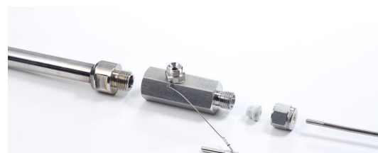
Exploded view showing: Probe - non heated handle . swageloc ferrul and nut with thermocouple end.